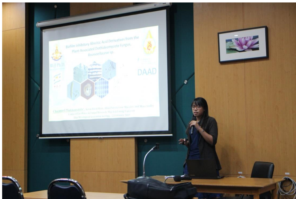
The oral presentation of a Thai PhD student from Mae Fah Luang University