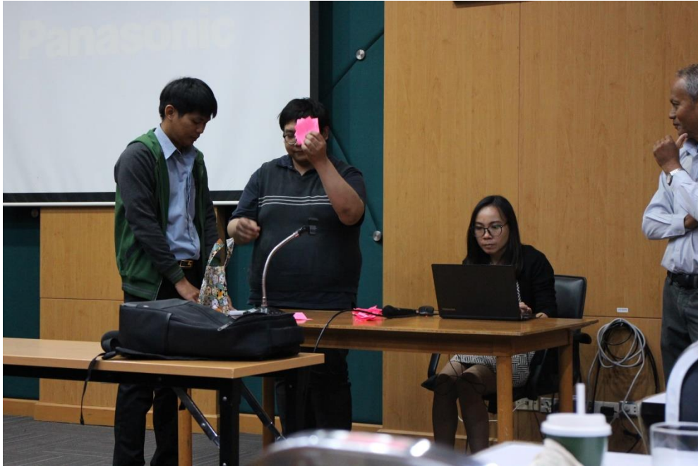
The election of TMA president